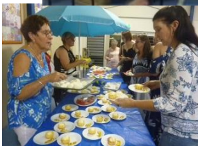
Members and guests enjoy the fun.