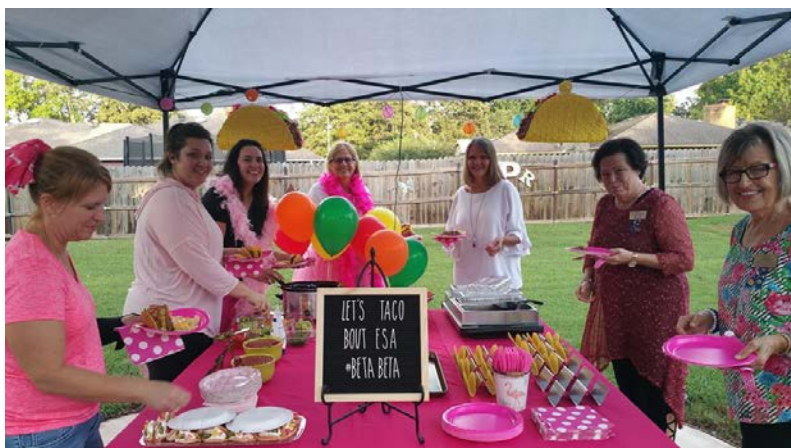
Beta Beta chapter, Holdenville, OK hosts “Let’s TACO ‘bout ESA” party

Looking for an awesome social to invite guests to your chapter after the holidays? Try ESA’s new national activity, TACO PARTIES! Chapters all across the country are right now planning taco parties to welcome new members. These parties are great for both established chapters and for initial gatherings for new chapters. Find taco trivia, video link to share with people you’re inviting, recipes and more on at www.epsilonsigmaalpha.org/tacoparty (no log-in required).