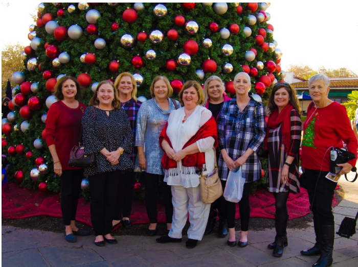
The Kappa Beta Holiday Tea at the Dallas Arboretum was an incredible day, with perfect weather & special memories. Christmas Tree,