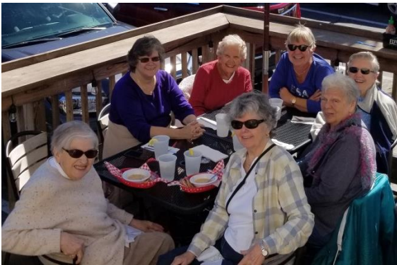
A jolly group after a Jolley Trolley ride is pictured below.

We're looking forward to Bay Area Council dinner meeting in January and Leadership on "that other coast" come spring.